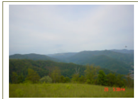
Taken Memorial Day weekend, 2005 in Harlan County, Kentucky.